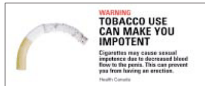
Figure 4. Example of a warning label currently found on cigarette packages in Canada

Upon setting eyes on the pack, a smoker is immediately reminded that what he is doing is not for the best of health. Pictures of corpses and drags taken through a stoma are just the beginning. The picture will be placed right in front of the pack, taking away from the once beautiful design that was there. Now, a smoker is forced to face his demons head on instead of flipping a pack on its side to see what's up. Good thing the FDA is on its game; we wouldn't want people doing things like smoking, drinking, or eating raw meat. That might kill you.